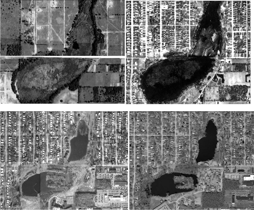
Figures 2-5.—Aerial photographs illustrating the change of Bacon’s Swamp through time. 2. 1941 (top left). 3. 1959. 4. 1986. 5. 2014 (bottom right).

Bldv. on the north and south and by College Ave. and Keystone Ave. on the east and west (T 16 N, R 3 E, Sec. 6; with latitude and longitude at the center 39^{\circ}51'17''\text{N} , 86^{\circ}07'40''\text{W} ; Fig. 6).